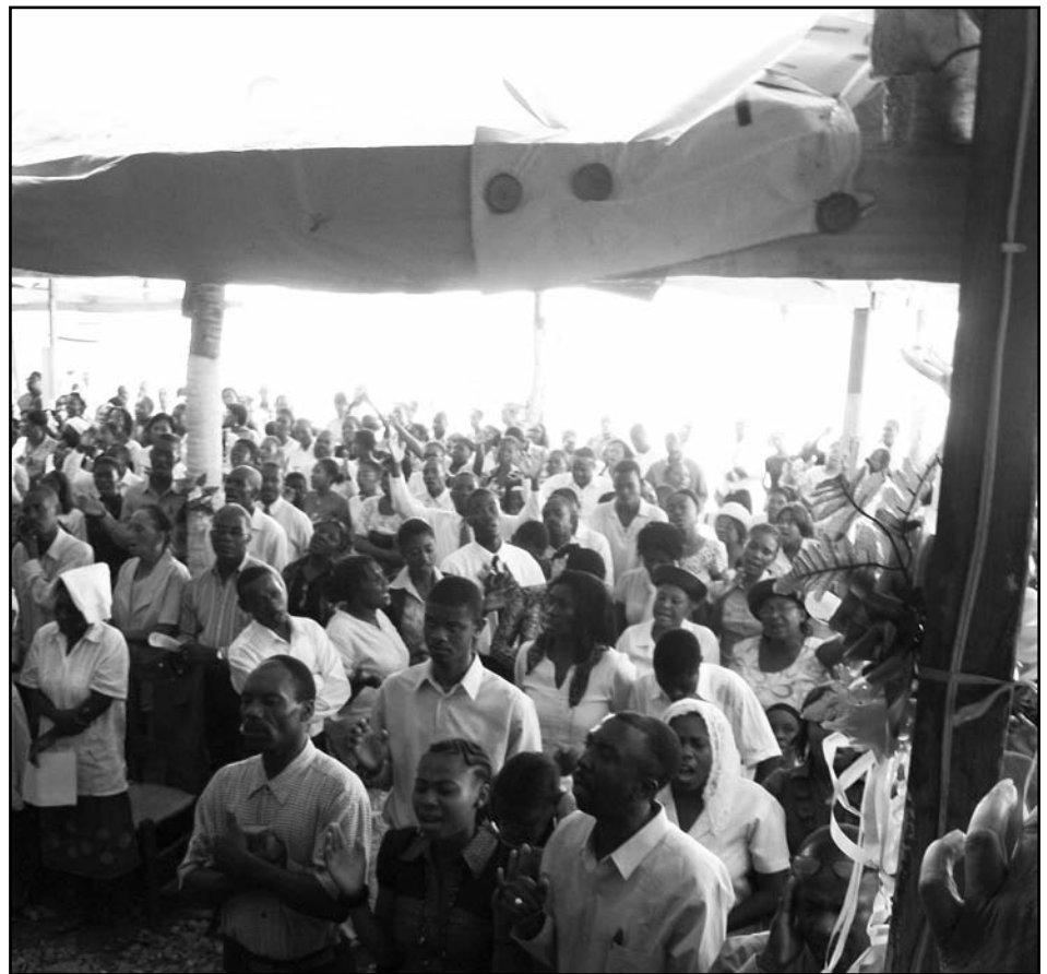
Worship services being held outside under a tarp because the church was destroyed