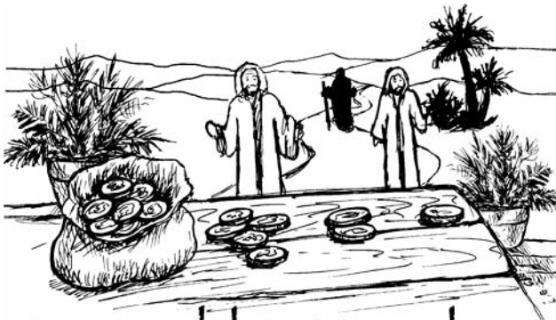
The Parable of the Talents